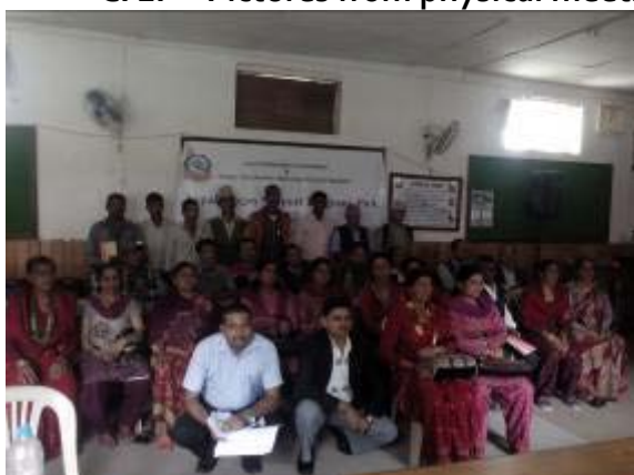
Group picture of participants