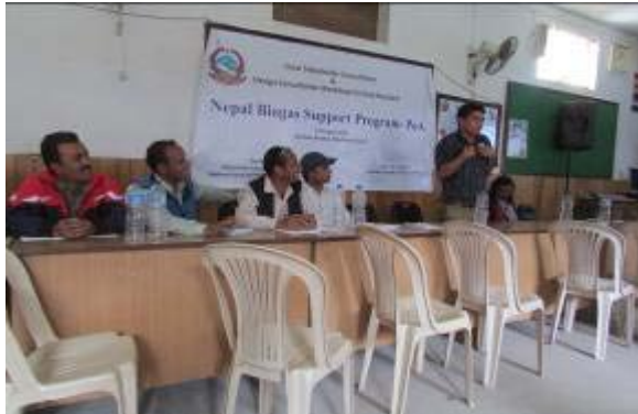
Discussion on sustainability indicator