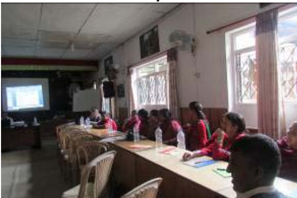
Filling the SD matrix