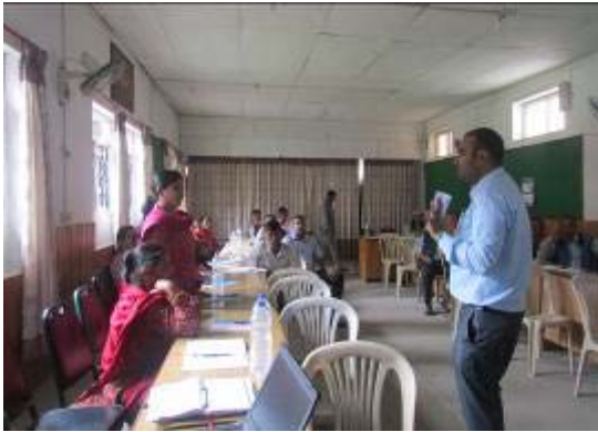
Participant sharing her view on Sustainability indicator