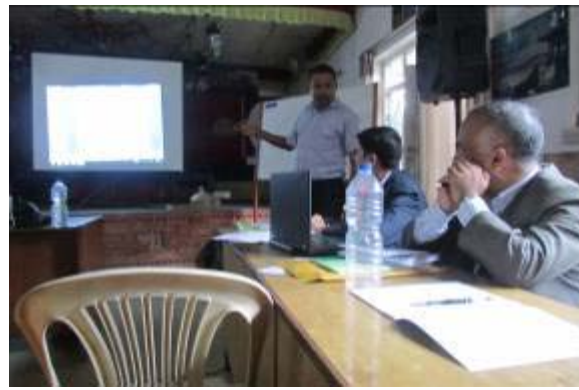
Discussion on PoA Design