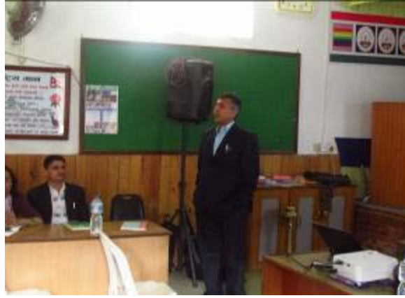
Remarks from Chairman