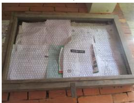
Invitation Posted in notice board of Women and Children Welfare Office