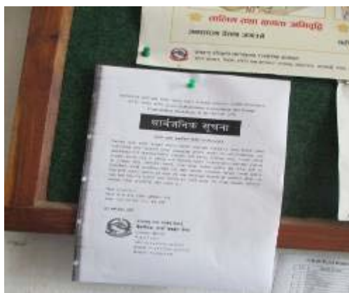
Invitation Posted in notice board of District Development Office