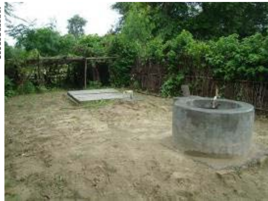
Fig: Plan and Section View of Biogas Plant