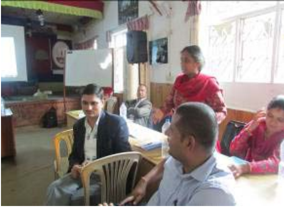
Experience sharing from user