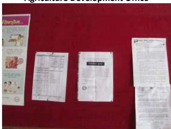
Notice Pasted at a Public Place