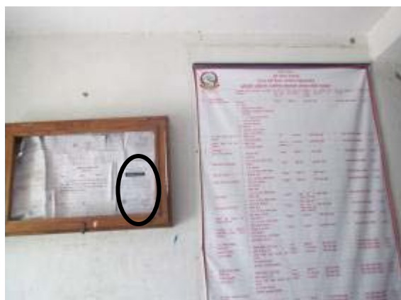
Invitation Posted in notice board of District Agriculture Development Office