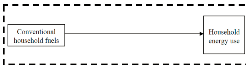
Figure B.4.1: Baseline emissions. Sources of GHG emissions and uses