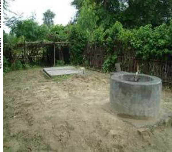
Fig: Biogas Digester in Operation