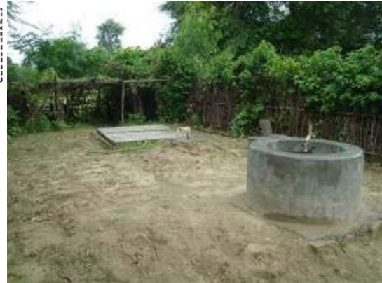
Fig: Plan and Section View of Biogas Plant